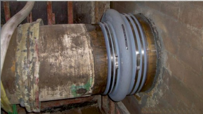
Expansion joint for penetration seal combined with compensation of expansion