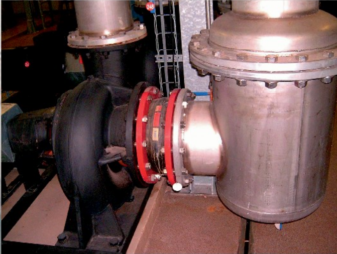
Gaswashing application for proces gas (desox)