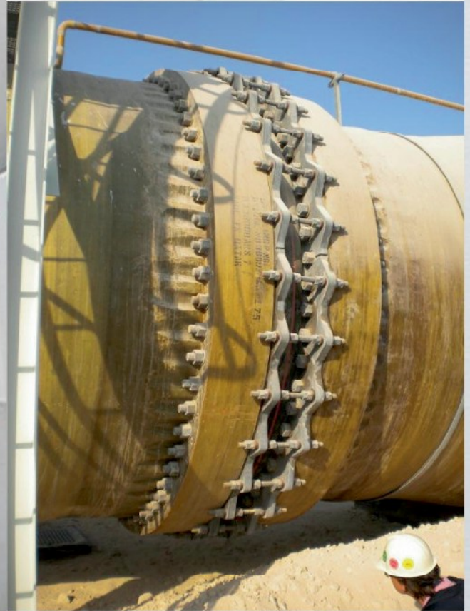
Expansion joint DN3450 for a desalination plant