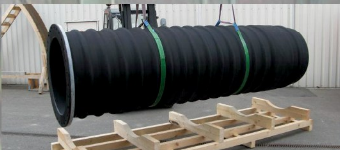
Flexible connection DN900 with total length of 3900 mm