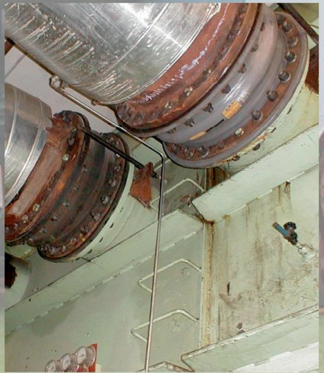
Connections to a turbine group